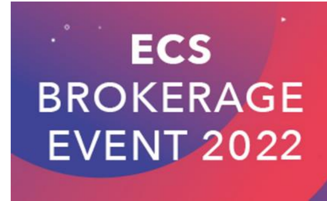
Xecs Brokerage 2022 18 th -19 th January 2022