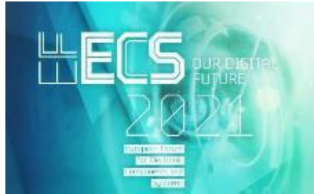
XEF ECS 2021 23 rd - 25 th November 2021